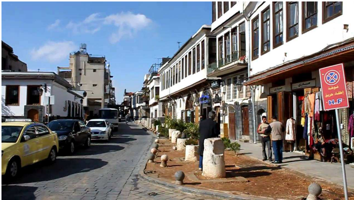
Straight Street, in modern times, before the war.

Q Why were they baffled that Jesus of Nazareth was indeed Yeshua, the Messiah?