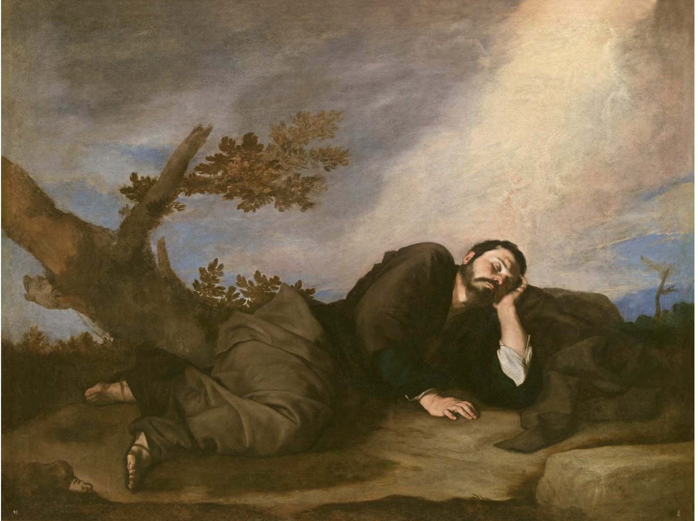
–Museo del Prado